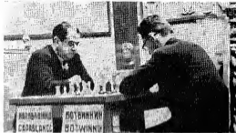
6. Moscow, 1955